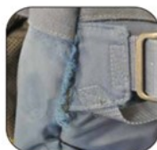
BROKEN SEAM. SEAM ALLOWANCE UNDER SPECIFICATION