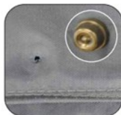
POPPED RIVET ON SPORTS BAG BASE