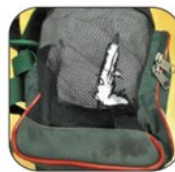
CUT / TORN MESH - MISUSE

~ Direct customer to Spartan recommended repairer ~