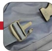
BROKEN BUCKLE - MISUSE