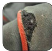
CORNER WORN. EVERYDAY WEAR AND TEAR