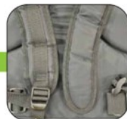
BAR TACK STITCHING ON SHOULDER STRAP MISSED IN PRODUCTION