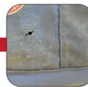
SEVERE DRAGGING / SCUFFING - MISUSE