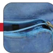
SEVERE DRAGGING / SCUFFING - MISUSE