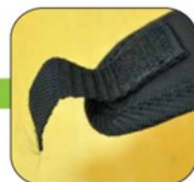
WEBBING NOT TAKEN INTO SEAM SUFFICIENTLY